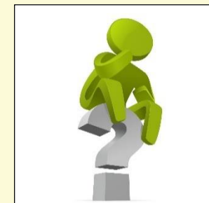
TBD Hydrologic Scientist