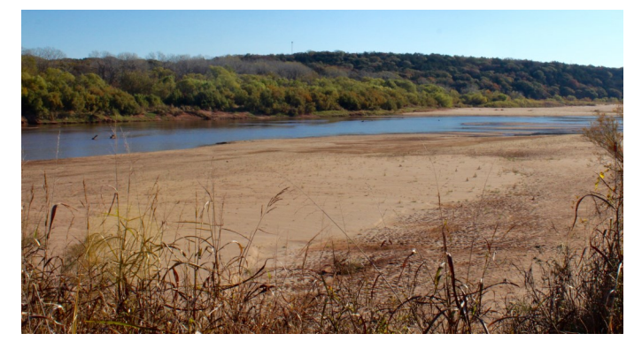
The Lower Cimarron River Watershed is one of five of the Oklahoma EPSCoR special study areas. Changes in water resources are the driving factor for several of our team's research questions.

Because no one socio-ecological question fits all of the study areas, our researchers are focusing on the most pressing issues in each of the study areas. The Oklahoma City group, for example, wants to explore urban water demand and the effects a changing water demand has on ecosystems and land use. Meanwhile researchers in the Lower Cimarron River Watershed wonder how extreme climate events, such as drought, decrease the stability of human and ecological systems in the Cimarron River Watershed.