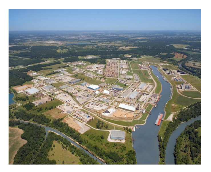
Aerial view of the Port of Catoosa

The 2,500-acre Port of Catoosa is located at the head of the navigation system. It hosts 72 industries employing over 3,900 workers. It is one of the largest, most inland public ports in the nation. It is a multi-modal facility providing cargo movements and/or transfers between barge, truck and rail and is the only port on the system with a roll-on/roll-off dock serving project cargo too heavy to transport over roads and bridges. It is the premier port on the MKARNS and serves as a Foreign Trade Zone as well.