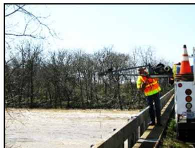
USGS Hydrologic Technician measuring streamflow during a flood on the Illinois River.

5. assessment of groundwater and surface-water quality in several Tribal Jurisdictional Areas of Oklahoma.